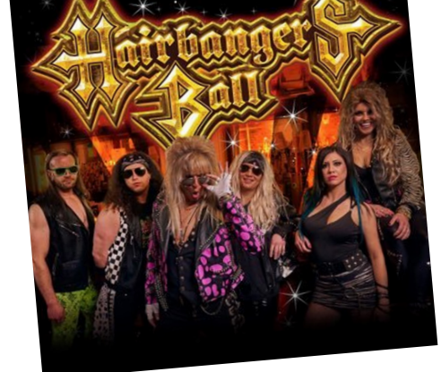
Hairbangers Ball Saturday, August 12